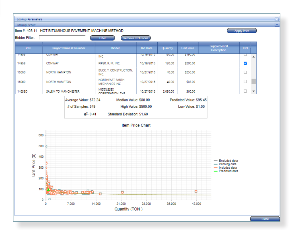
Item Price Lookup Graphing

iPD provides the ability for users to review the bid history of an item to help create an estimate price. The "Item Price Lookup" capability allows users to set basic parameters to determine what contracts are included in the analysis, based on bid letting date, location, winning/ non-winning bidders, etc. User can also include/exclude individual data points if they are outliers. The system provides the user with statistical measure of the price as well as an mathematical best fit to the item prices based on the quantities used.